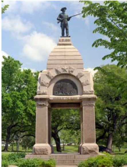
Heroes of the Alamo Monument

http://www.tspb.state.tx.us/SPB/Gallery/MonuList/01.htm