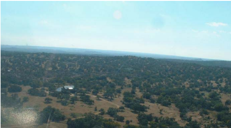
Castillo, José L.. [Land with trees]. The Portal to Texas History. http://texashistory.unt.edu/ark:/67531/metaph22065/ . Accessed July 28, 2009.

Introduction: To capture students' attention, you might show them a few pictures of Texas landscapes, such as the one below.