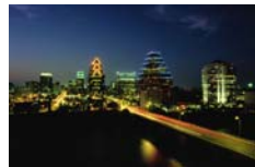
Austin at Night -- Image Date: 17/09/1999 -- Image Date: 17/09/1999