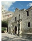
The Alamo -- Image Date: 24/06/1999 -- Image Date: 24/06/1999