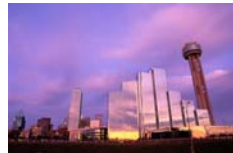
Dallas Skyline -- Image Date: 17/09/1999 -- Image Date: 17/09/1999

Introduction: Examine the pictures with your students. Discuss favorite places and people to visit in these or other Texas cities.